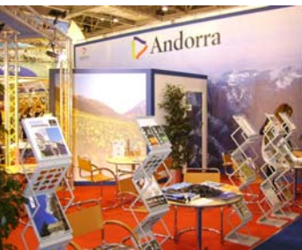
Andorra at WTM - never again to be confused by Travel Daily.

After World Travel Market in London last week we now know exactly where Andorra is - just over the aisle from Belgium and across from Madrid.