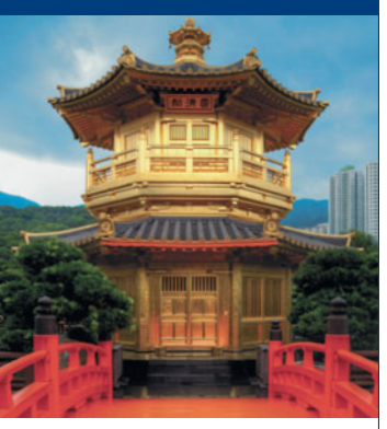
Terms and conditions apply